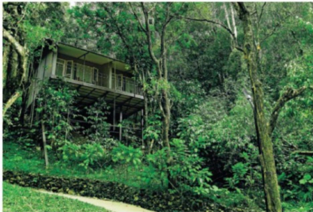
Wayanad Wild cottage