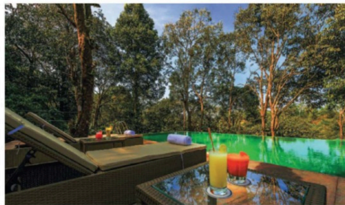
Wayanad Wild poolside

camping masters in South Africa, Sawai Shivar by TUTC tents are made of 100% canvas, setting them apart from other tented experiences in the region. Each private and intimate suite tent features ensuite bathrooms, private wooden decks, and the exclusive Presidential Suite Tent boasts a private plunge pool.